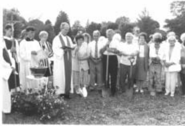
Holy Family Church ground-breaking ceremony on June 22, 1996