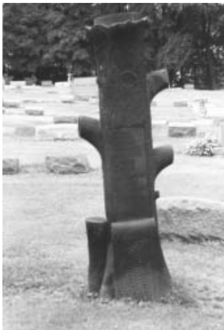
One of the early monuments was made to resemble a tree