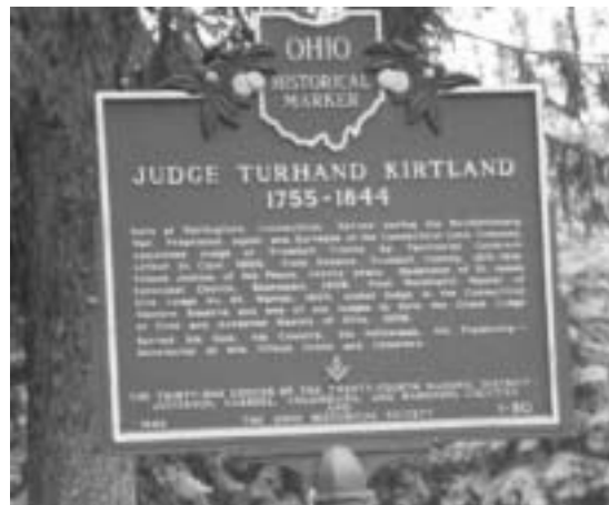
This Marker is at the Cemetery

The Presbyterian Church Cemetery is located next to the Presbyterian Church, in Poland Township, (Range 1, Town 1) in the old Western Reserve, southeast of the center of Poland