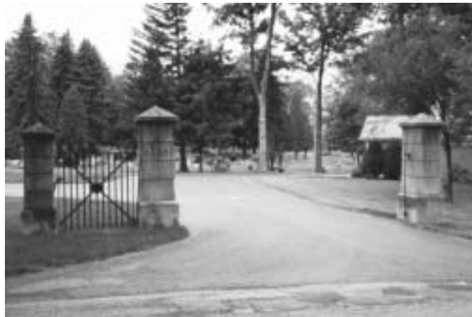
Established in 1884