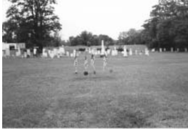
Better known as the Struthers Road Cemetery