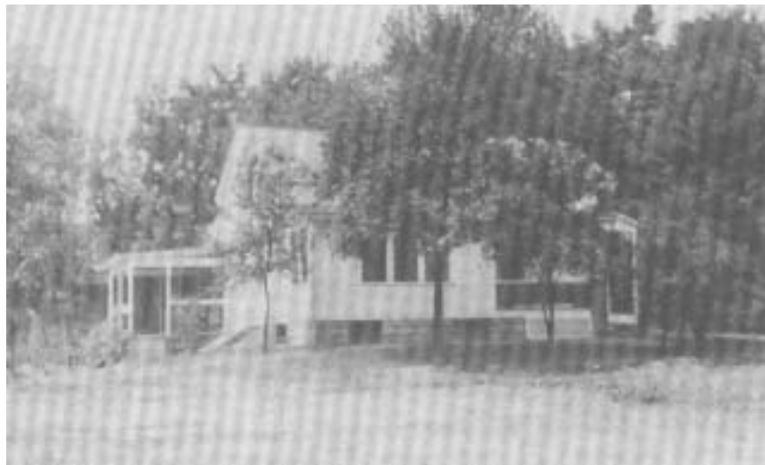
Our Home 9 College Street