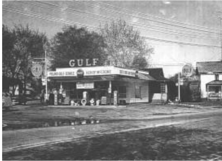
McCrone's gas station on the northwest corner of Rts. 224 and 170 before the widening.