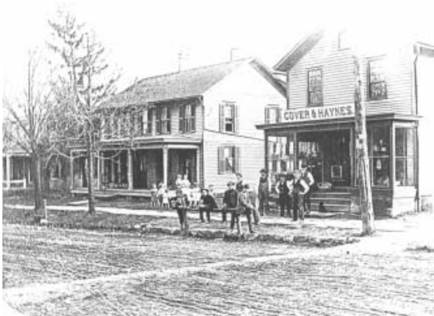
Cover Home( Formally McKinley's Home) and store